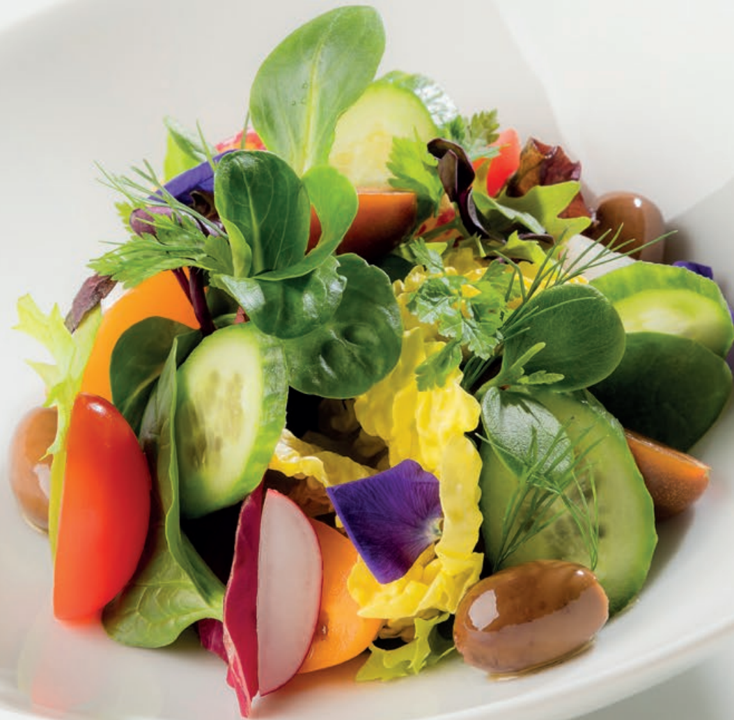
Colourful Mixed Salad Leaves